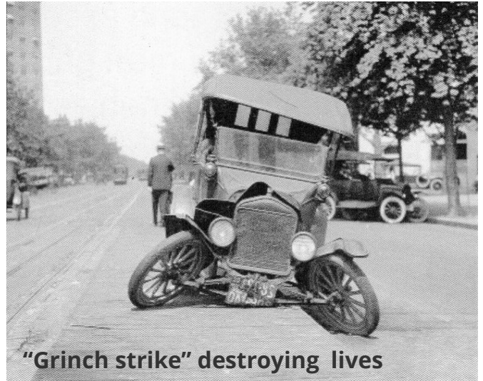
“Grinch strike” destroying lives